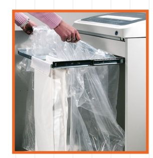
EASY TO REMOVE BAGS Slide out tracks made it easy to empty the two waste collection bags.