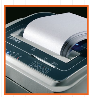
HIGH SHREDDING CAPACITY Shreds up to 47 sheets at at time.