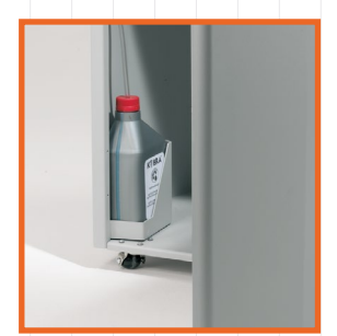
INTEGRATED AUTOMATIC OILER: it eliminates the need to manually lubricate the unit, ensuring maximum reliability, efficiency and capacity.

EPC Electronic Power Control Shows the shredding load required to optimize shredding without jams.